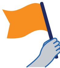
MINDSET & LEADERSHIP STYLE