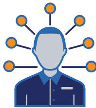
COMPETENCIES & EXPERTISE